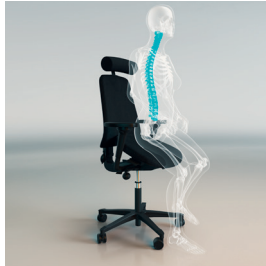
Sit in a balanced position