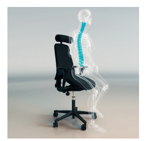
Sit in a balanced position