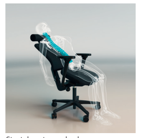
Stretch out your body